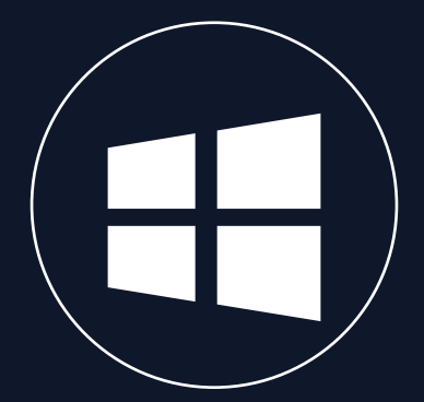
Windows 11 Operating System