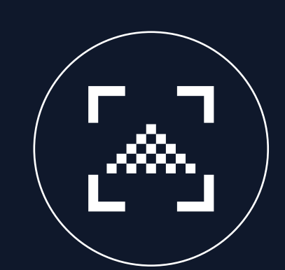
1920*1080 Screen resolution